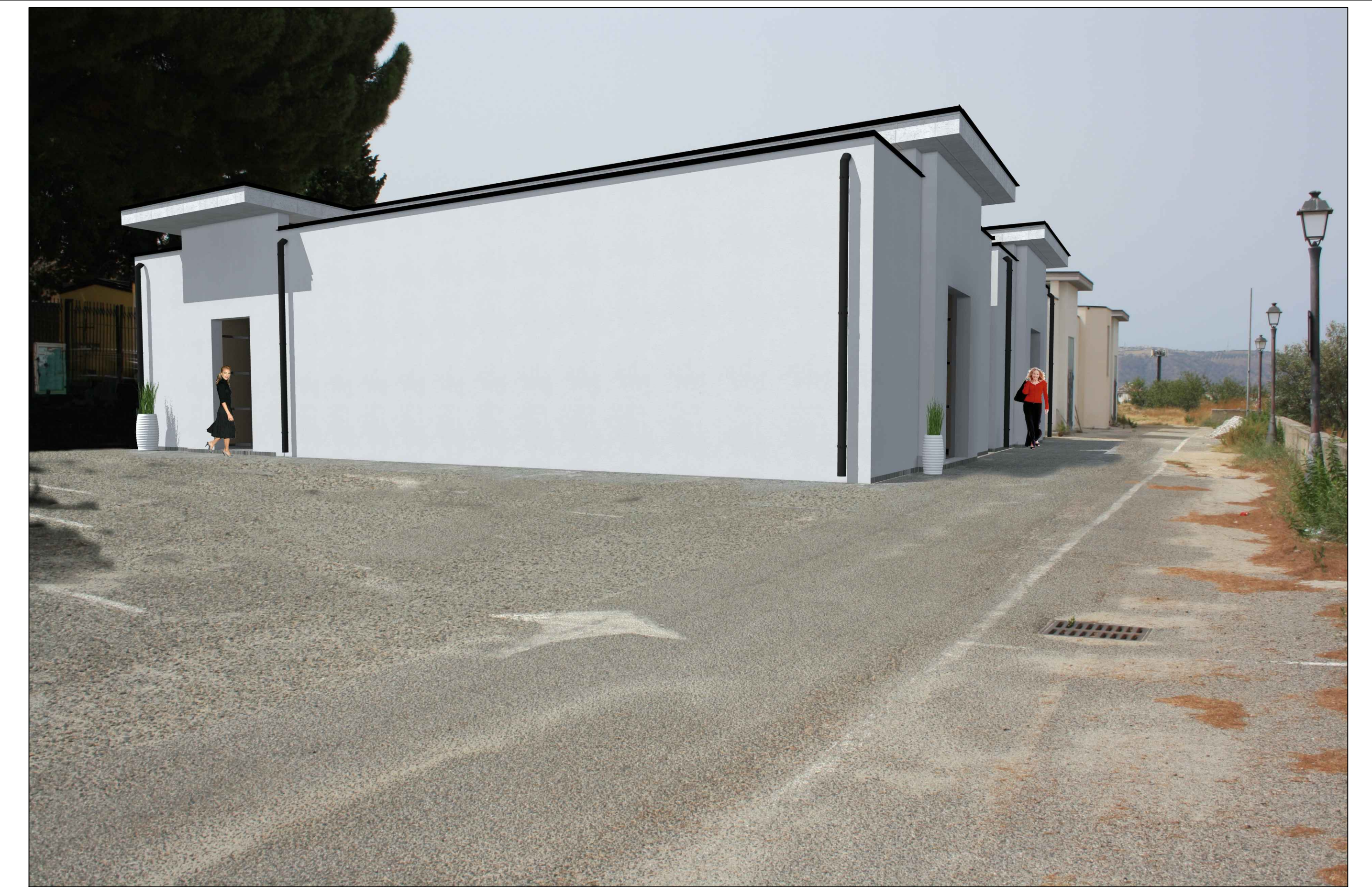
CAPPELLA FUNERARIA COMUNALE